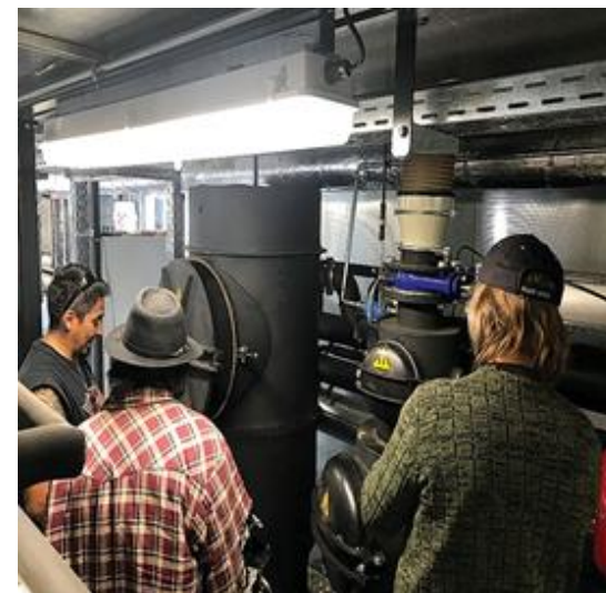
Kwadacha First Nation Biomass System